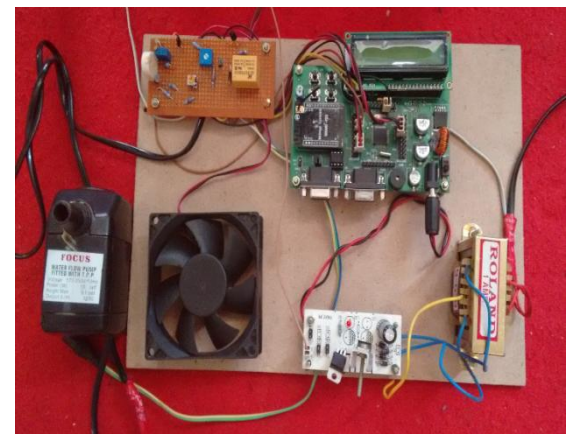
Fig 2 Transmission Section

command. A Liquid Crystal Display (LCD) is a thin, flat and given to one end of pump. Soil moisture sensors measure the water content in soil. A soil moisture probe is made up of multiple soil moisture sensors. This Soil Moisture Sensor can be used to detect the moisture of soil or judge if there is water around the sensor, let the plants in your garden reach out for human help. Insert this module into the soil and then adjust the on-board potentiometer to adjust the sensitivity. The sensor would outputs logic HIGH/LOW when the moisture is higher/lower than the threshold set by the potentiometer. With help of this sensor, it will be realizable to make the plant remind you: Hey, I am thirsty now, please give me some water.